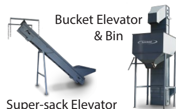
Bucket Elevator & Bin